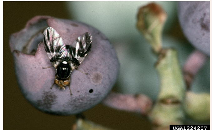
Muuqaal 1. Diqsigira miraha mareerka adult

Diqsigira waaweyn ee miraha mareerka galaa waa diqsi midab madow leh oo qiyaastii dherarliisu yahay ½ cm. Astamaha lagu garto diqsigira waxaa ku jira boga hoose in uu ku leeyahay baro mad-madow oo ifa oo cirifka ku leh dhibico cad, (scutellum), iyo garbo muuqda oo leh diilimo madow oo leh qaabka xarafka “W” ama “M” (Muuqaal. 2). Diqsigira miraha mareerku ee waaweyni waxa uu aad ugu eg yahay diqsigira tufaaxa ( R. pomonella ) (Muuqaal.3). waxaana sidoo kale lagu khaldaa diqsigira ankaaxka