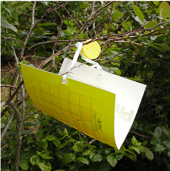
Muuqaal 5. Kaarka jaalaha ah ee xabagta leh ee “qaabka v” u sameysan V-orientation ee lagala socdo diqsiyada miraha mareerka.