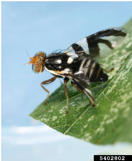
Muuqaal 2. R. mendax waaweyn.